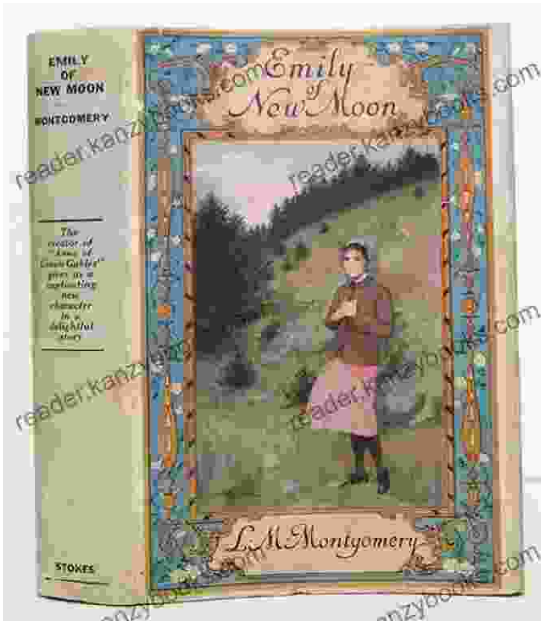
Emily of New Moon by L.M. Montgomery

Step into the captivating world of Emily of New Moon, a timeless classic by the beloved author of Anne of Green Gables, L.M. Montgomery.